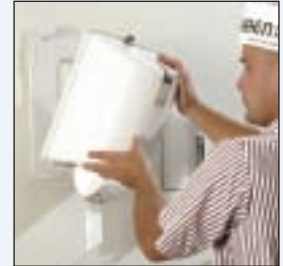
Easy to Load