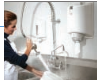
Convenient operation in wet or humid environments

The Tork M-Box Pro WT is a high-capacity towel dispenser perfect for wet or humid environments, such as food-processing plants and food-preparation kitchens. It supports HACCP guidelines and features a design that is durable, reliable, hygienic and watertight.