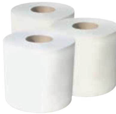
The M-Tork Centerfeed System roll towels provide users with ideal softness and strength.