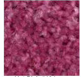
Hot Pink #404