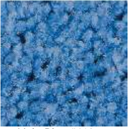
Light Blue #410