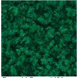
Emerald Green #421