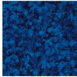
Royal Blue #403