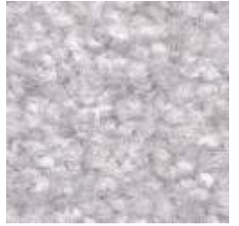
White Silver #402