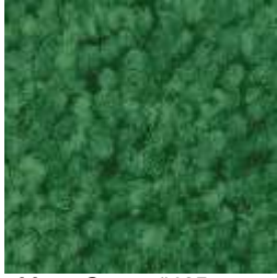
Moss Green #405