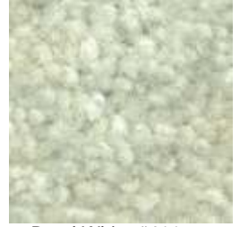
Pearl White #411