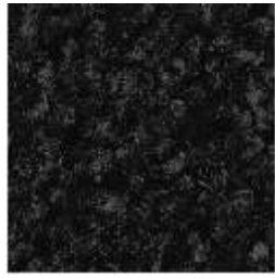
Black # 401