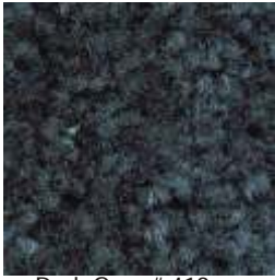
Dark Grey # 419