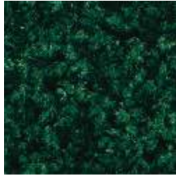
Forest Green #422